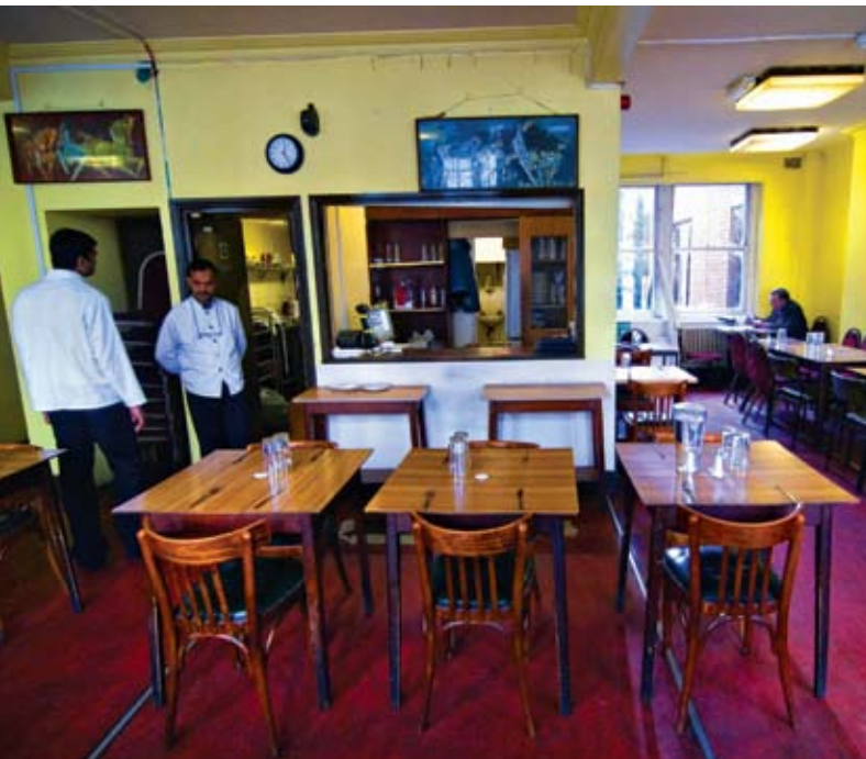
The India Club has changed little since 1947

water jug and salt-and-pepper pots. Inside, London businessmen and students rub shoulders with workers from the Indian High Commission enjoying the hearty and affordable South Indian fare.